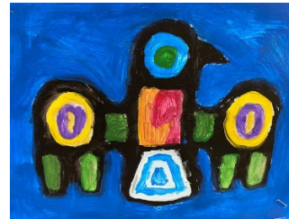
Thunderbirds Inspired by Norval Morriseau - Division 3