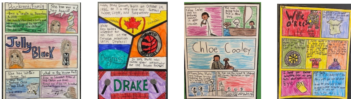
'February and Forever' Study of Black Canadians – Division 3