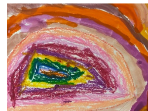
Circle Art – Division 9