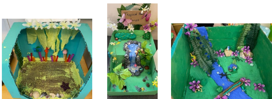
Biome Dioramas – Division 5

For registration information and link, please visit: https://burnabyschools.ca/registration/