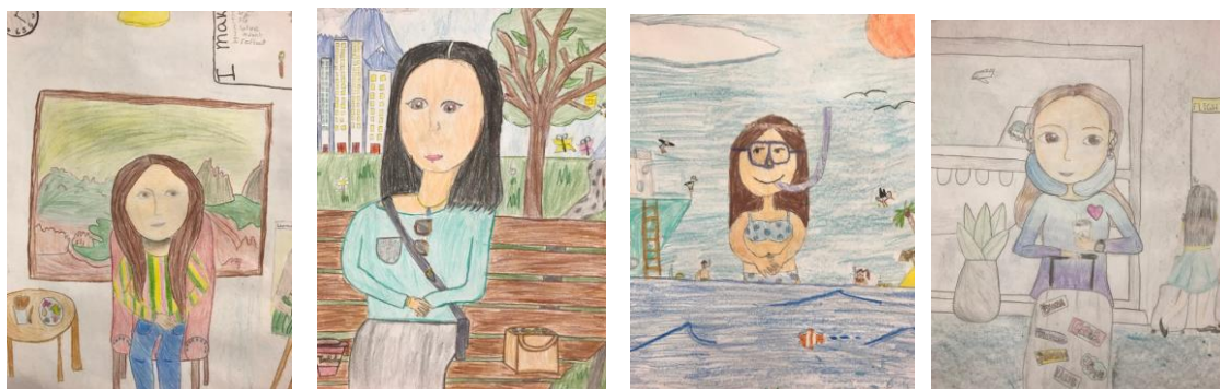
Modern Day Mona Lisa - Division 4