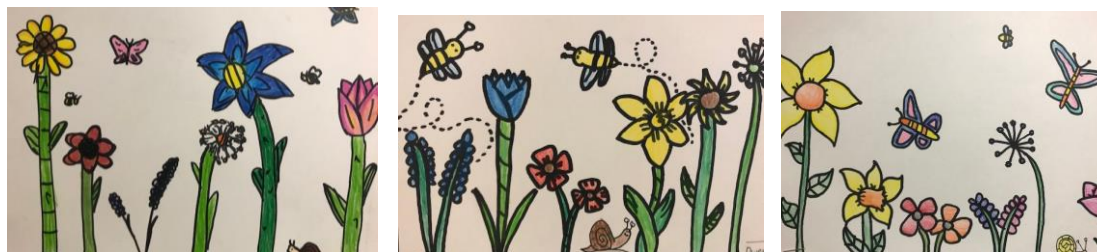
Spring Pictures - Division 4