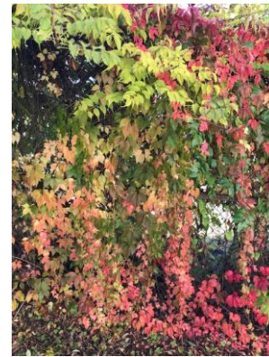
Cascading Colours in our School Grounds