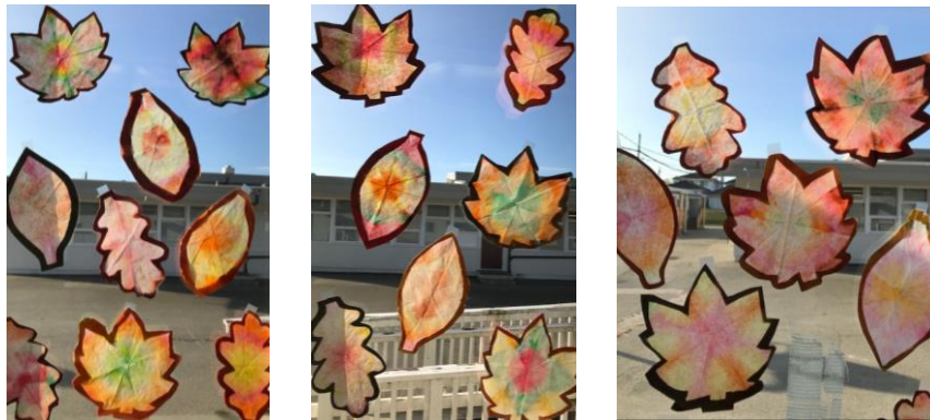
Autumn Leaves – Division 5