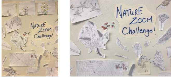
Sketches in Nature - Division 3