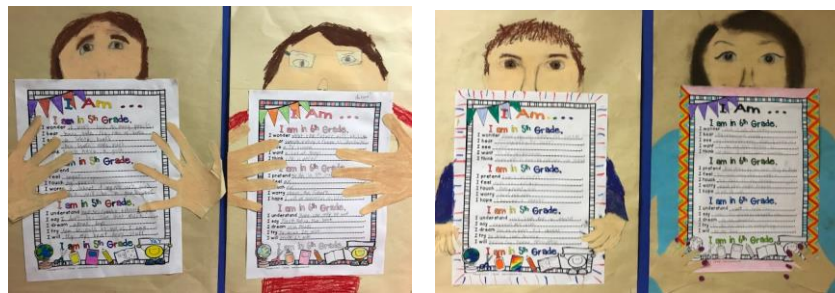
All About Me - Division 2

*Please check the page "Clubs and Teams" on our school website to stay informed. The "Clubs and Teams" page can be found under the "School Info" tab on our home page.