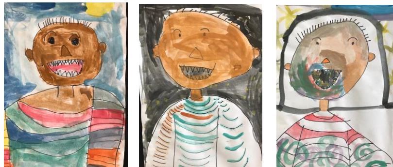
'No David' Pictures - Division 9

Friday, Oct. 5 th – Divisions; 1 (Coutts), 2 (Safarik), 3 (Cardamone), 6 (Sale) & 7 (Torres)