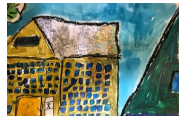
Natural Environment Scenes