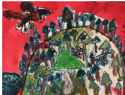
Natural Environment Art