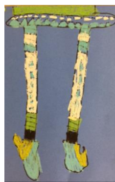
Winter Stockings – Division 10