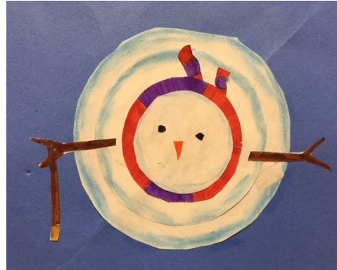
Perspective Art – Division 1