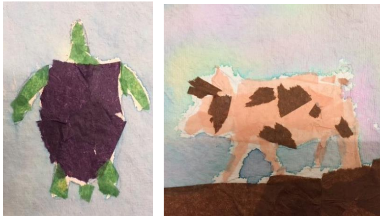
Animal Collages – Division 8