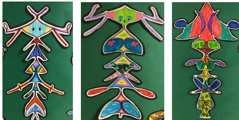
Name Designs – Division 4