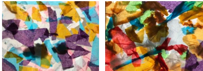
Tissue Paper Stained Glass – Division 8

We will be hosting another Parent Coffee morning on Tuesday, February 6 th at 9AM . This will take place in the staff room. Coffee/tea and morning snacks will be provided. We look forward to discussing more current topics with you at that time. All parents are welcome!