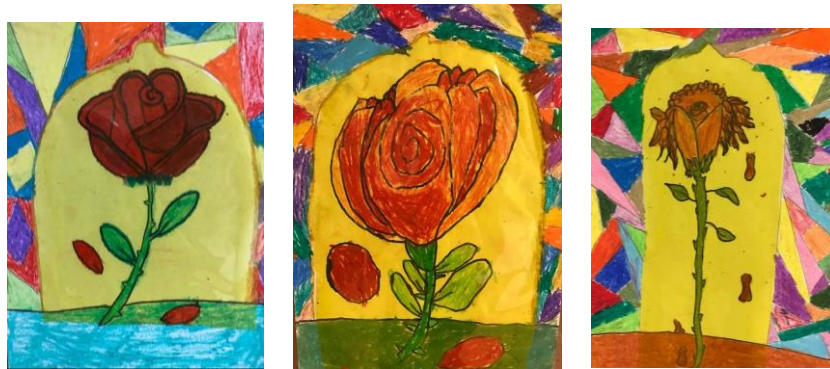
Oil Pastel Roses – Division 7