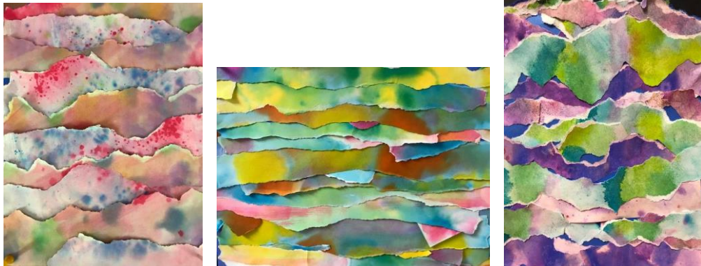
Texture Art – Division 1