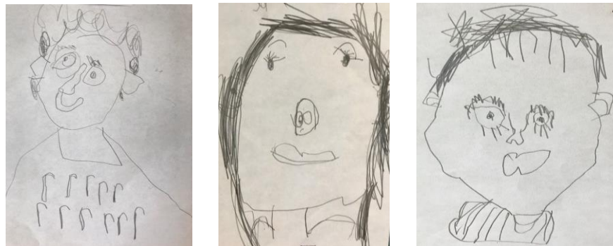
Self Portraits – Division 9