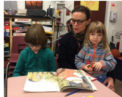
Family Literacy Day Photos