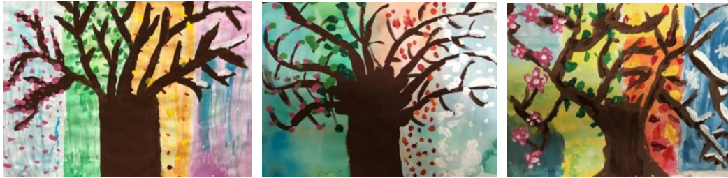
All Season Trees – Divisions 5 & 6